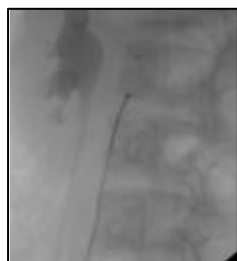
8: Snaring an Amplatzer device of muscular VSD with a AS5 AndraSnare (5mm) after embolization into abdominal aorta