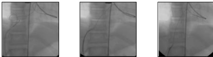
5,6,7: Using 20mm snare to fish wire again into right atrium without any problem